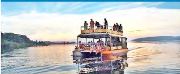
Nile lunch cruise ($30pp)