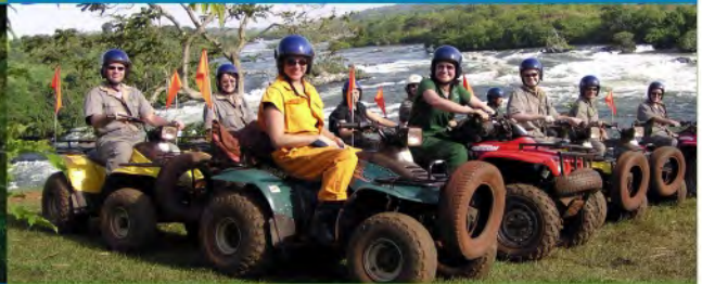
Quad Biking ($85 - 2 hr per pax)