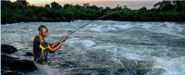
Fishing from the island ($15 per rod hire per 2 hrs)