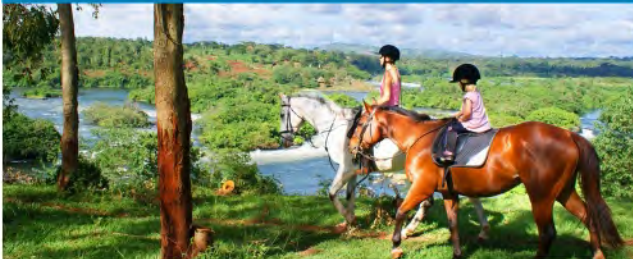
Horse Riding ($60 - 2 hr per pax)