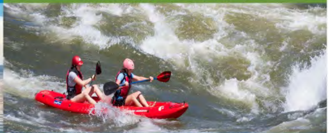
Kayaking - Half Day - $95pp (Min 2 Pax) - Full Day - $125pp