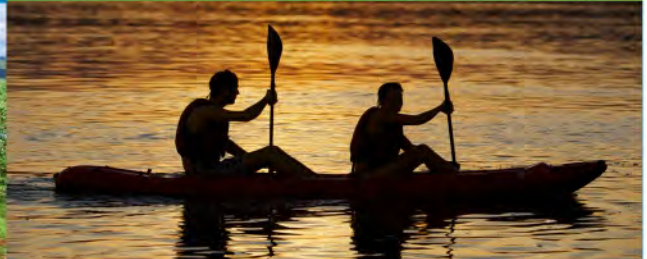
Sit on Kayaks/Stand Up Paddle Board ($75pp min. 2 pax)