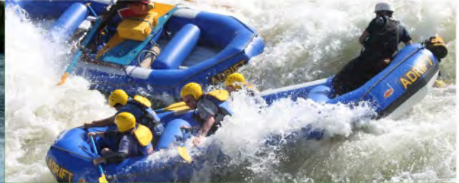
Whitewater Rafting - Half Day - $125pp - Full Day - $140pp