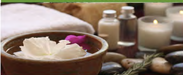
Wildwaters Spa Treatments